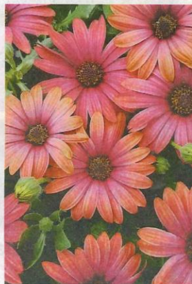
Sakata Seed America

Height and spread: 12-18 inches. Full sun.