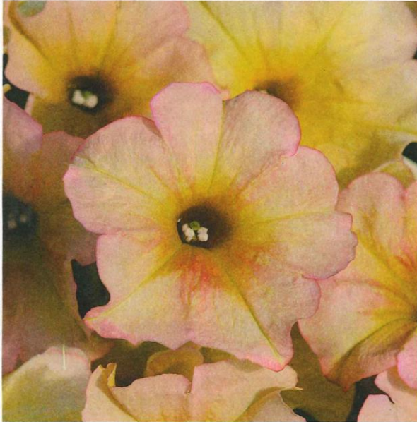
Burpee Home Gardens