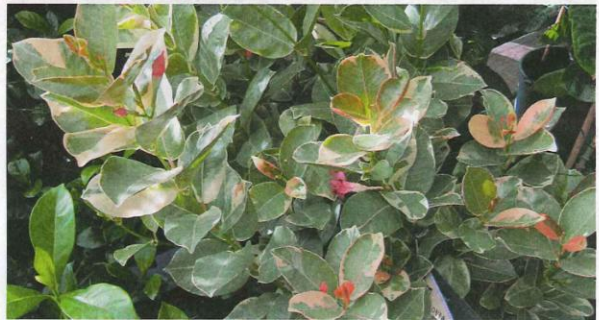
Julia Hofley (2)

Height: 6-10 inches. Spread: 20-24 inches. Full sun.