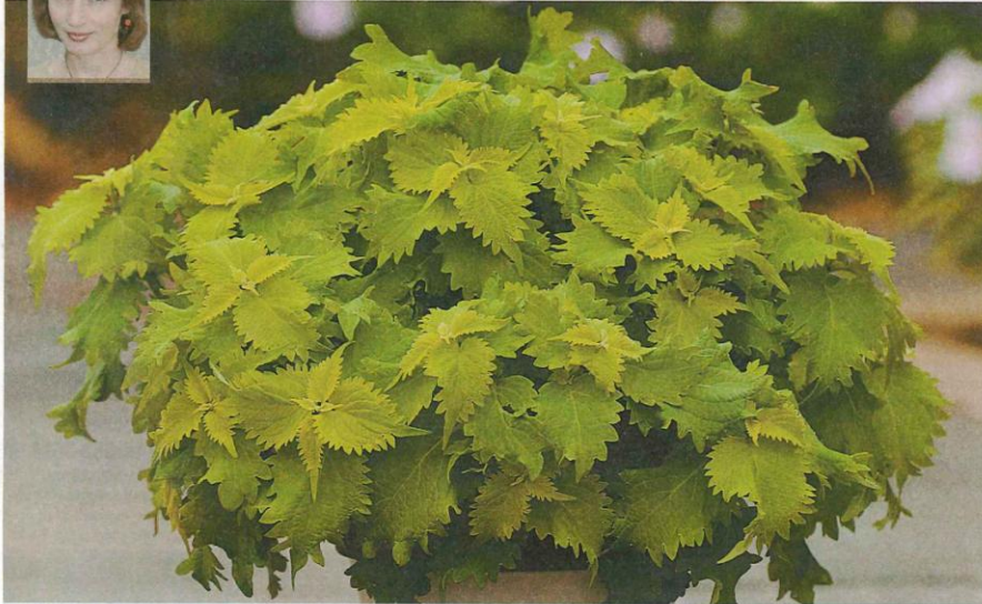
Burpee Home Gardens